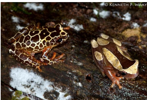
Both Phases