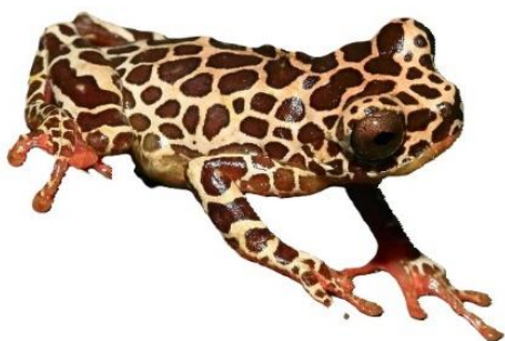
Giraffe Phase