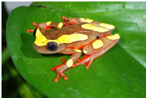
Clown Phase