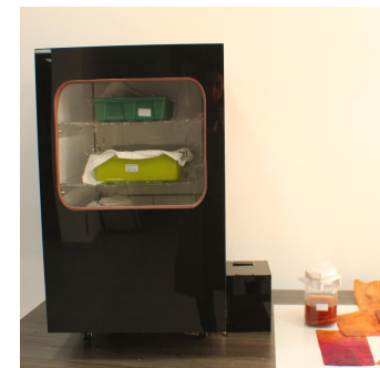
Start adding your bacteria cellulose solution & Glass Jar