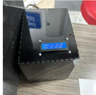
Assemble the outer black box