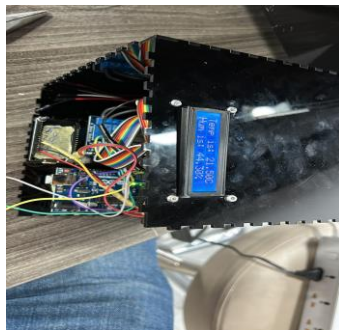
Checking the cable of the wire connection of the electronics