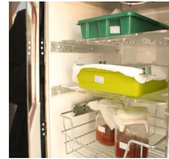
Installing the hinges, Pvc strip, magnetic