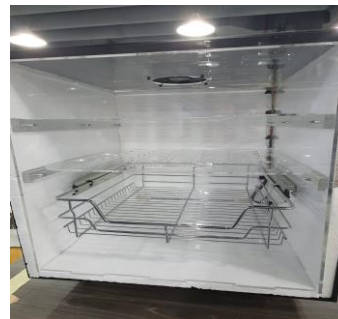
Tun on the power