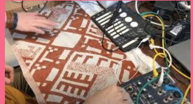
Woven Sample - 5th Synth Effect