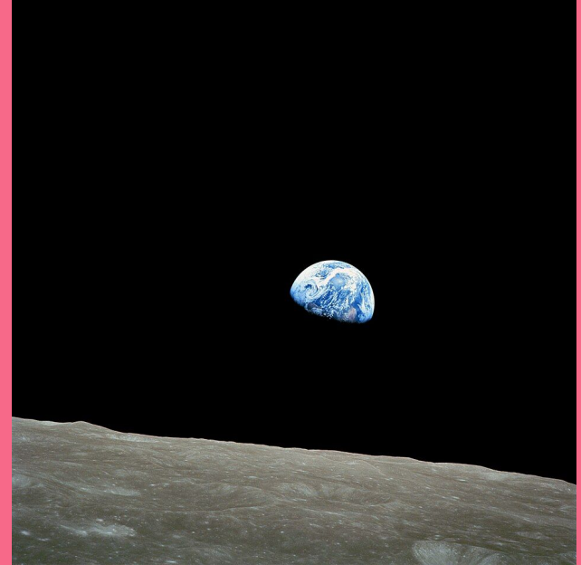
Earthrise , December 24, 1968, taken by Apollo 8 astronaut William Anders