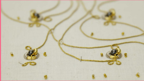
Embroidered Computer , Irene Posch