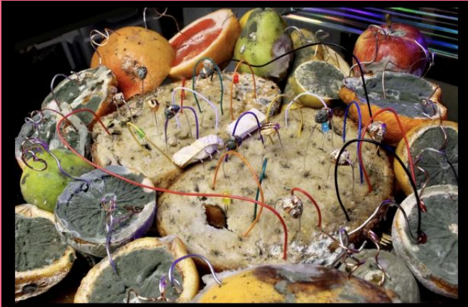
There once was a strange little planet called Earth, Sneha Ganguly