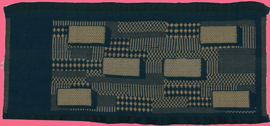
A Fabric that Remembers, Unstable Design Lab